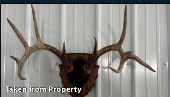
Taken from Property