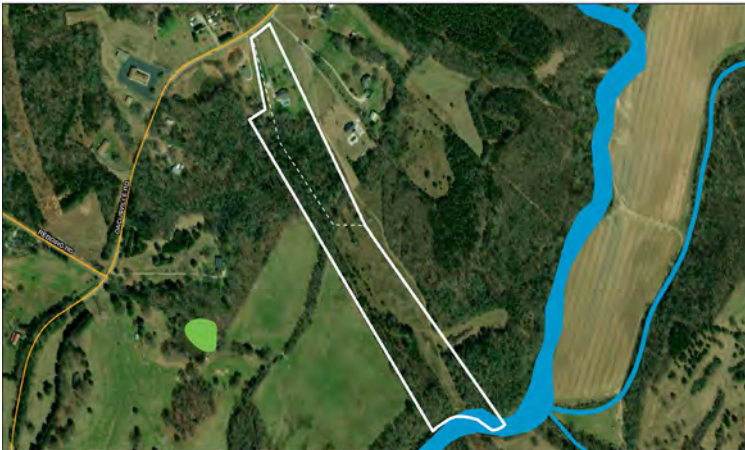
National Wetlands Inventory

17.18 ± Acres Dacusville Rd., Marietta, SC 29661