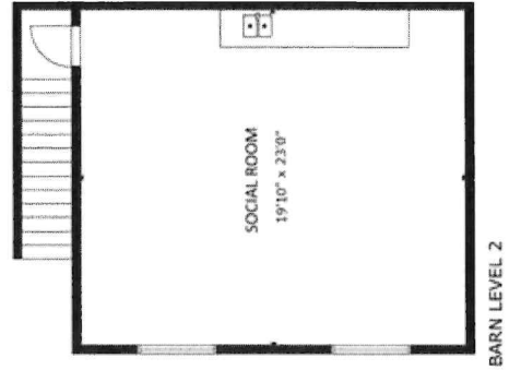
BARN LEVEL 2

This floorplan was generated using LIDAR scanning technology. All layouts and figures provided are approximate and intended for illustrative and marketing purposes only.