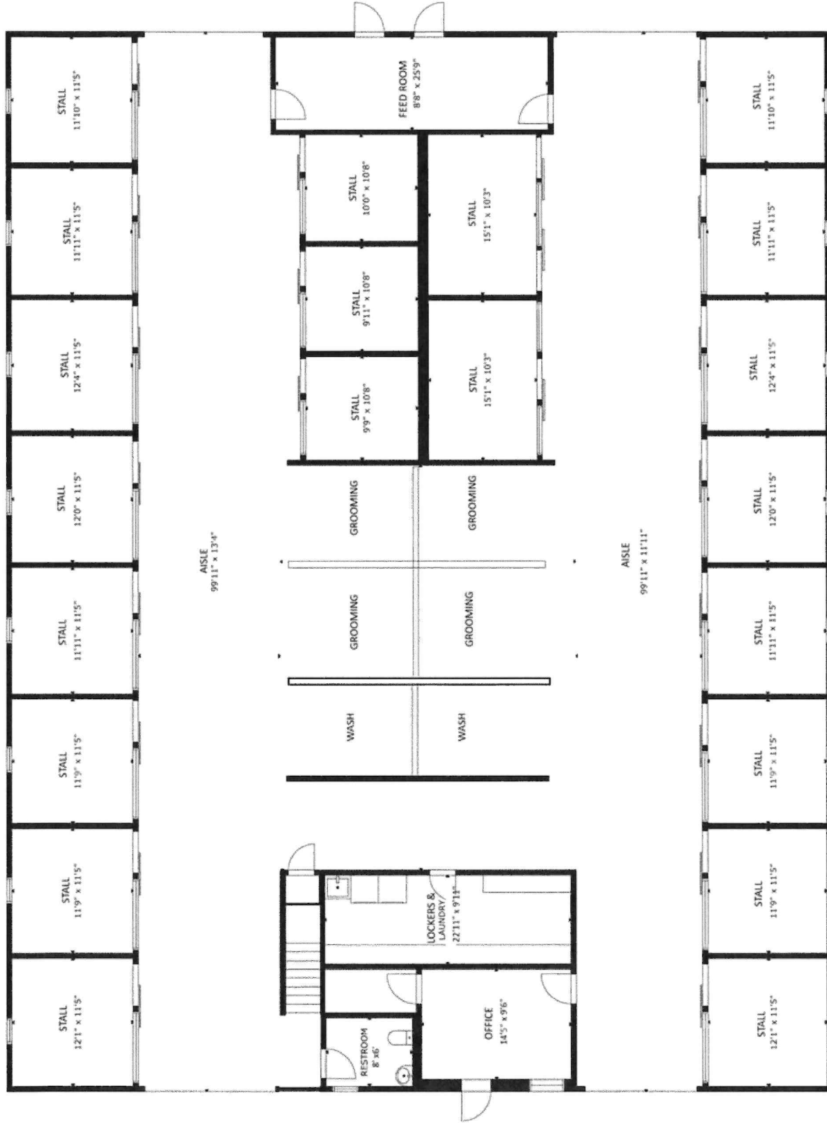
BARN LEVEL 1

This floorplan was generated using LIDAR scanning technology. All layouts and figures provided are approximate and intended for illustrative and marketing purposes only.