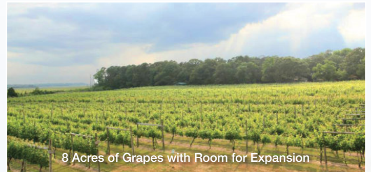
8 Acres of Grapes with Room for Expansion