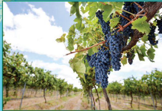
NATALI VINEYARDS (BRIGANTI BY THE BAY WINERY)