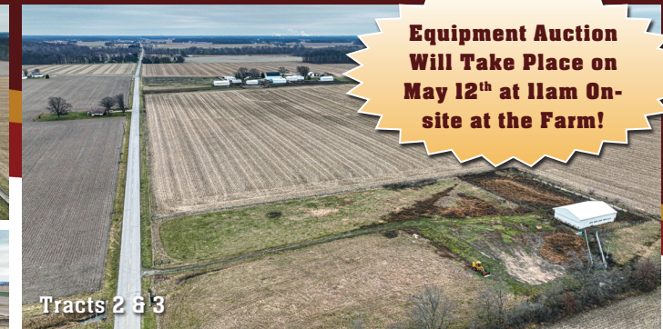
Tracts 2 & 3