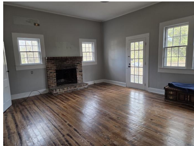
3 rd Bedroom or Den