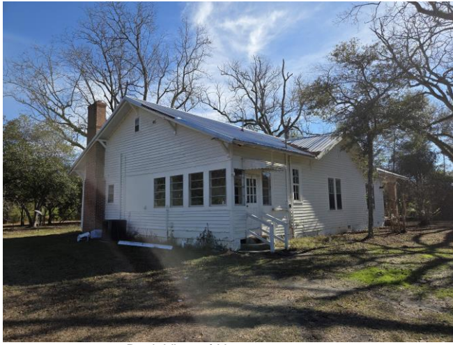
Back View of House