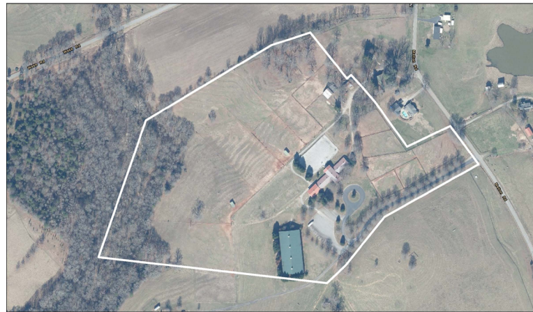
National Wetlands Inventory

37 ± Acres Melton Rd., Pendleton, SC 29670