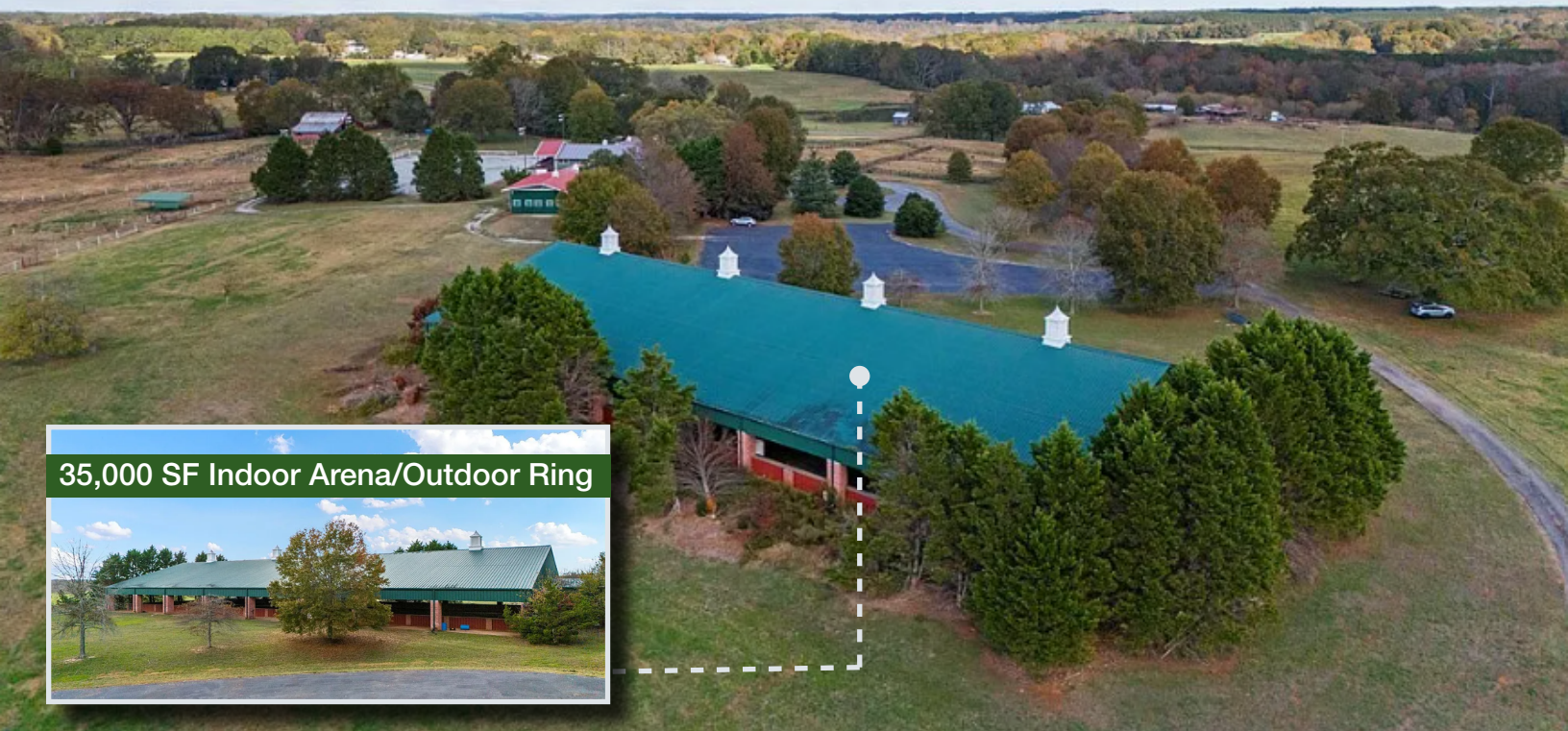
35,000 SF Indoor Arena/Outdoor Ring