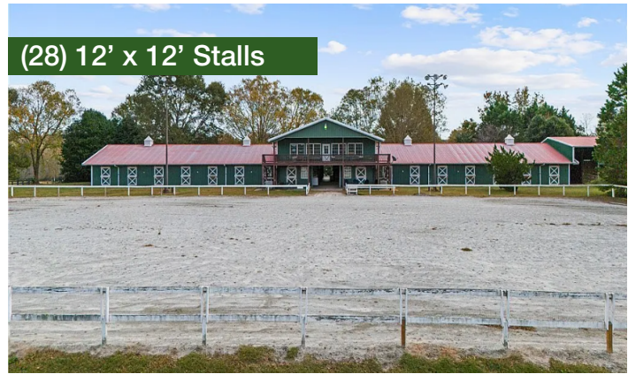
(28) 12' x 12' Stalls

Full utilities – electricity, water, septic, and phone – are already in place. Ideally located minutes from Clemson, Anderson, Pickens, Easley, and Greenville, with easy access to Charlotte, Columbia, and Atlanta. The ±37 acres also offer room to build a custom home and create a private homestead alongside a thriving equestrian operation.