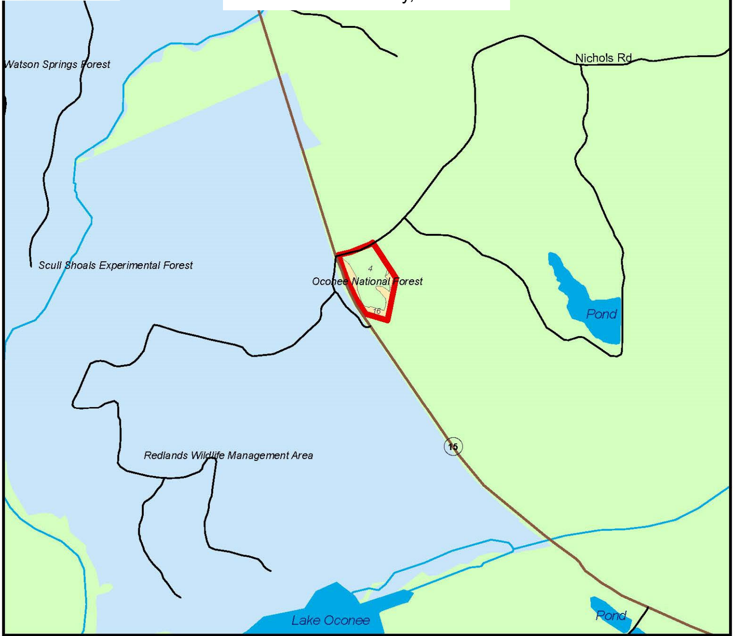
C. Lewis 1 - Stand Map C. Lewis 1 Parcel # 13133Hh1n12 Greene County, GA - approx. 16.25 Acres +/-